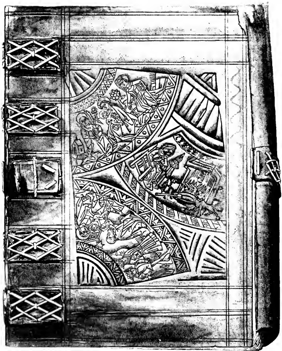
COVER OF THE ORIGINAL MANUSCRIPT